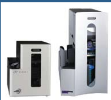
Automated CD/DVD/BD recording, printing and reading thanks to the state-of-art Rimage production robots.

Perennity works with almost all Dicom viewers. We offer IQ-View Lite as an option. You may add any other Dicom application(s) to each CD/DVD. You may also configure the Dicom viewer to autorun when inserting the disk in a CD/DVD reader.